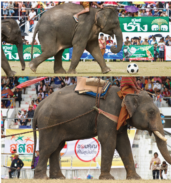
Fig. 1. (upper) Alcohol sponsorship banner ads (green banners on the stand) at the Surin elephant round-up festival 2007; (lower) the alcohol sponsorship banner ads were replaced with no alcohol and smoking ads in 2008. (For interpretation of the references to colour in this figure legend, the reader is referred to the Web version of this article.)